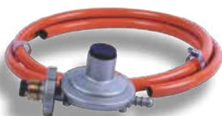
Premium Bullnose kit. GASREGPBK-1 1m Kit GASREGPBK-2 2m Kit