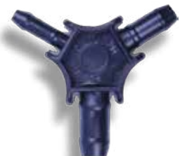
PEX Reamer 1216 to 2025