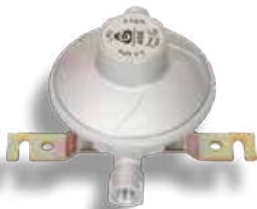
Changeover Regulator 4 kg/hr