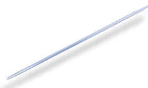
Internal Bending Spring