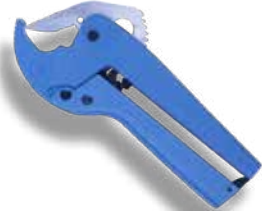
PEX Pipe Cutter