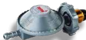
Eco Bullnose Regulator. 1 kg/hr, 2.8 kPa. GASREGEBR