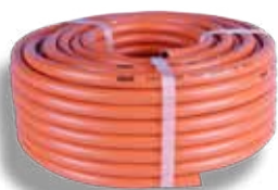
8mm Gas Hose. - 30m Roll GASREGGOS