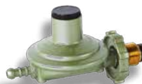
Premium Bullnose Regulator. 1.2 kg/hr, 2.8 kPa. GASREGPBR