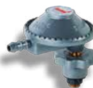
Eco Swivel Regulator. 1 kg/hr, 2.8 kPa. GASREGESR