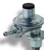
Premium Swivel Regulator. 1 kg/hr, 2.8 kPa. GASREGPSR