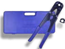
Crimping Tool Kit For 1216 TO 2632 PEX