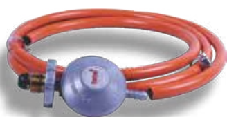
Eco Bullnose kit GASREGEBK-1 1m Kit GASREGEBK-2 2m Kit