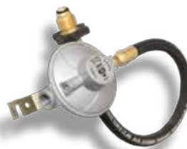
Changeover Regulator Kit Complete 4kg/hr regulator assembly with single pigtail