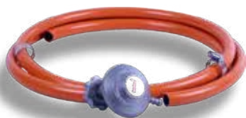
Eco Swivel Kit. GASREGESK-1 1m Kit GASREGESK-2 2m Kit