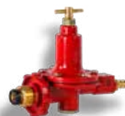
High Pressure Regulator. GASREGHPR