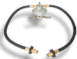
Changeover Regulator Kit Complete regulator assembly with c/o valve and 2 pigtails